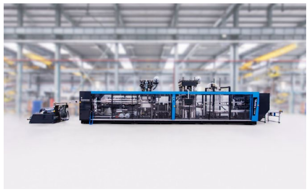
KMD 90 Smart for fast and efficient thermoformed-packaging production.