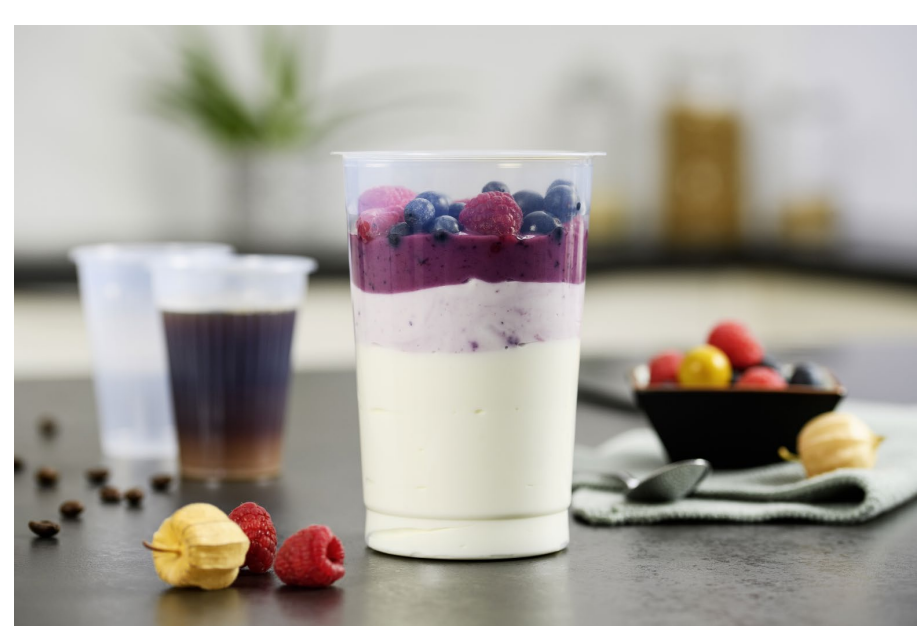
Heat-resistant C-PET light cups as sustainable alternative to PS and PP. © KIEFEL GmbH