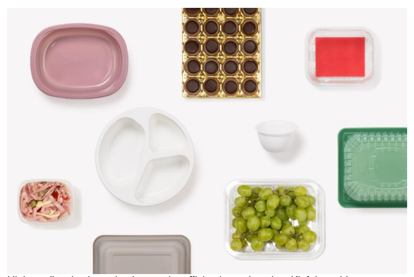
High-quality plastic packaging can be efficiently produced on Kiefel machines.

Visit Kiefel at the Brückner Group booth Hall 8a / C57.