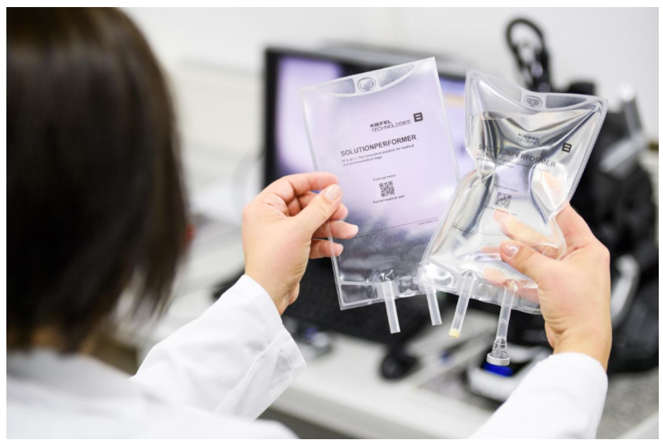
The SOLUTIONPERFORMER KFS can be used to produce a variety of bags.