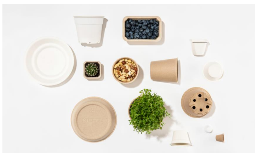
Variety of natural fiber packaging - from trays, cups to coffee capsules, containers for frozen food and more..