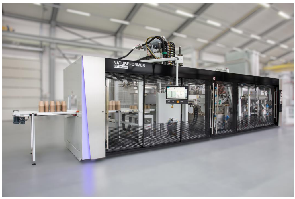
The NATUREFORMER KFT machine series was also among the finalists for the German Sustainability Award for Design.