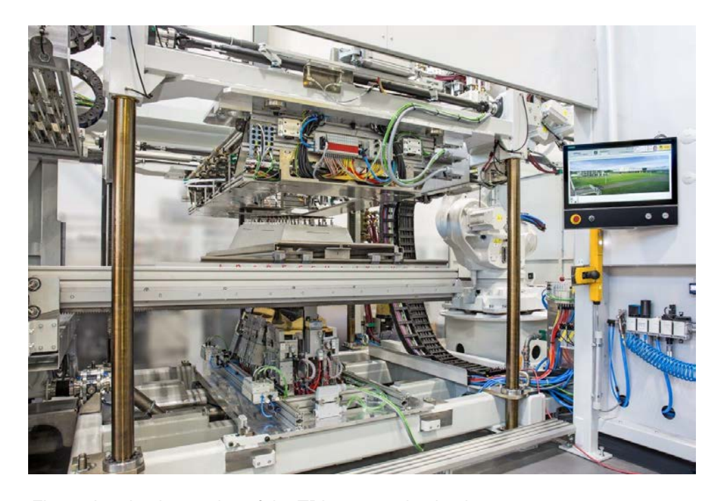
Figure: Laminating station of the TBL vacuum lamination system.