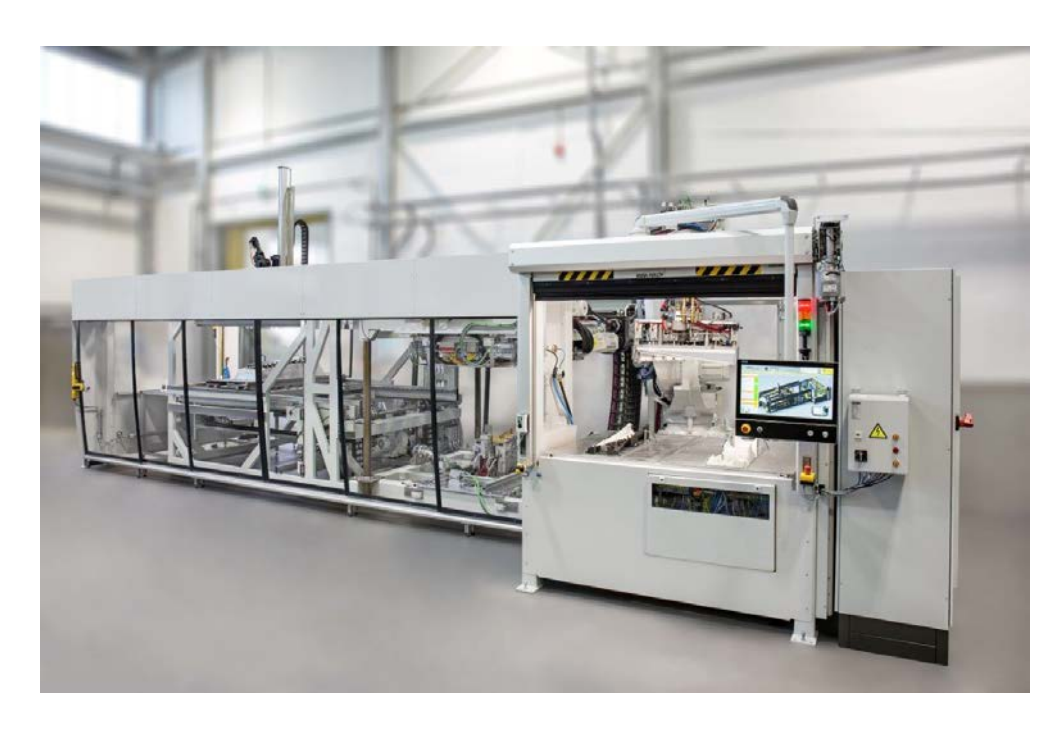
Figure: The new highly automated modular Kiefel vacuum lamination system utilizing the TBL process (Tailored-Blank-Laminating).